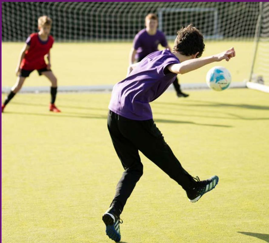
New Sports Hall