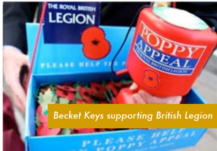
Becket Keys supporting British Legion

As ever, the shoe box appeal for Christmas is also proving a very popular way for students (and their parents!) to show their consideration of those less fortunate. Thank you for these as well!