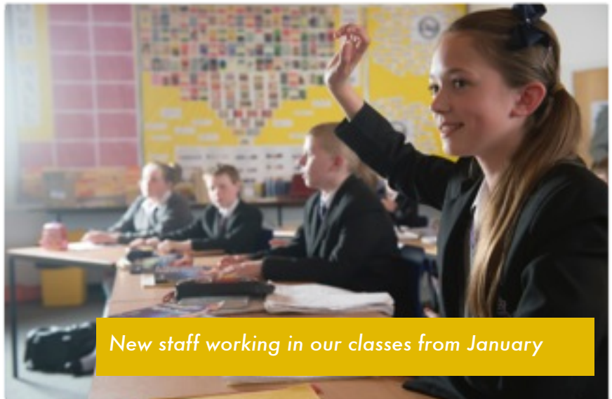
New staff working in our classes from January

We are delighted to have been joined by new students again at the start of the term and we pray that all those starting with us will quickly feel part of the community here at Becket Keys.