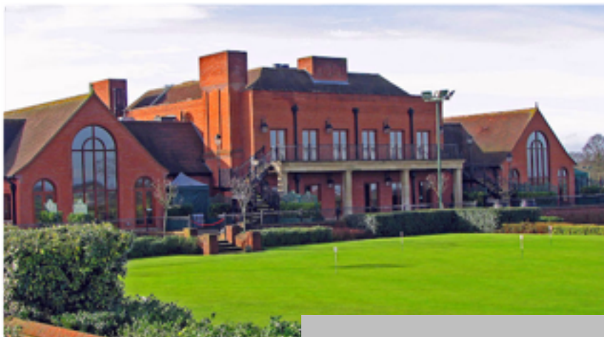
Stock Brook Manor

All families, students and staff are automatically made members of the association and are warmly welcomed to our AGM which is scheduled for Wednesday 15th October at 7pm. We will have an opportunity to enjoy some refreshments and socialise together. We will then listen to a short talk from one of our Mandarin Teachers about learning this fascinating language. Finally, we will spend a short time reviewing the work of FoBK last year and thinking ahead to this year. As part of the meeting, we will be electing parents and staff to the committee. Please contact me if you are interested in hearing more about this: staffenquiry@becketkeys.org .