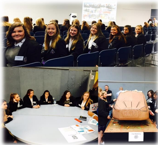
Pictured: Year 10 girls at the Ford Technical Centre for 'Women in Engineering Day'