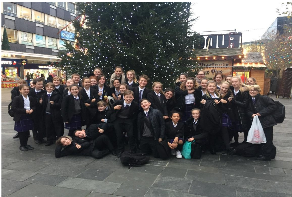
YEAR 7 ENJOYING THEIR PANTO TRIP LAST FRIDAY.