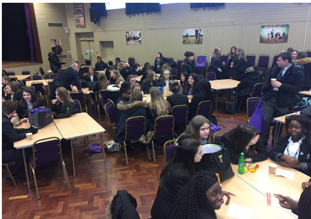
SIXTH FORMER FOR A DAY