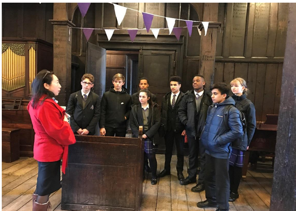
YEAR 9 STUDENTS DURING THEIR VISIT TO ETON COLLEGE