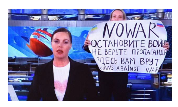
Free picture - independent media.

News outlets over the world have all been covering the Russia/Ukraine conflict, but have they all been presenting the same root of this casualty?