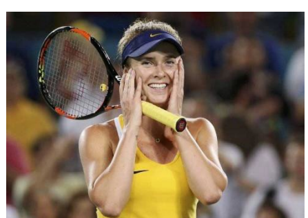
Elina Svitolina

Athletes who are innocent are being denied opportunities because they were born inside Russian borders, and stadiums and sporting facilities are not being given the opportunity to show off their love for their sport. This article has brought to light some of the ways the conflict has interrupted sport across the globe, it has also shown the resolve and character of athletes and sports stars we look up to as we all battle together against the Russian opposition, helping in any way we can, with whatever platform we have.